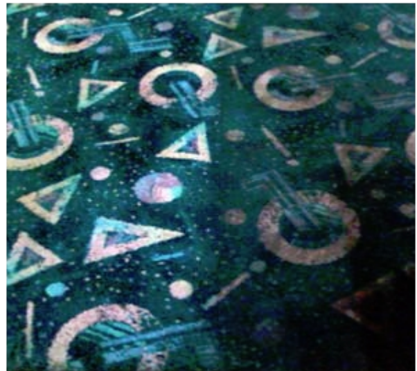
Bingo hall carpet before & after

Rotary scrub carpet cleaning is a method that is ideal for offices, hotels, common ways and carpets that must dry quickly and cannot be wet cleaned (i.e. carpet tiles and some industrial and commercial carpets).